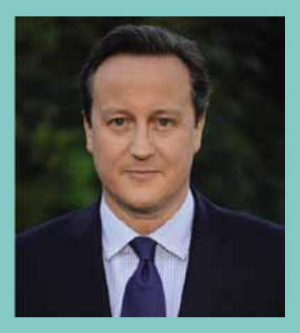
The Rt Hon David Cameron Former Prime Minister of the United Kingdom, 2010 – 2016